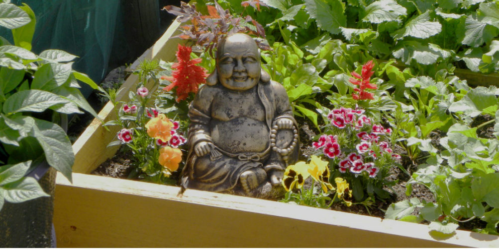
Image 2 - Personalising plots, Weaver's Square Allotments and Community Garden, Dublin.