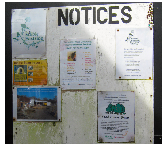
Image 5 - Notice board for sharing information, Edible Eastside, Birmingham. Photo: Susan Noori