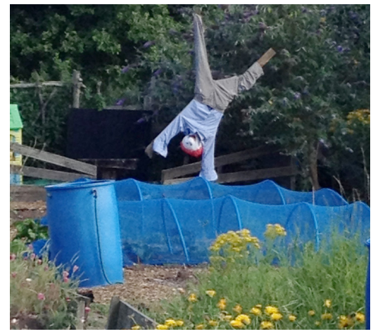
Image 3 - Personalising plots, Moor Green Allotment, Birmingham.