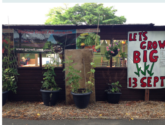
Image 7 - Providing communal space for social events and shared activities, Walsall Road Allotment.