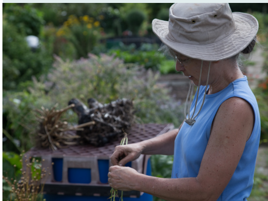
Image 6 - "I like to grow things in clumps ... and I mix stuff ... unusual stuff ... it looks better, it looks more natural ... like a forest or a wild field", (Plot-holder at Walsall Road Allotment). Photo: Susan Noori (picture taken with permission for public use)