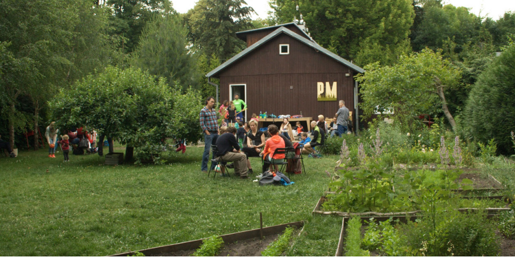
Image 4 - Summer garden party, Queen Bona Community Garden, Jazdów, Warsaw. Image, Beata J. Gawryszewska