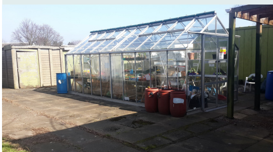
Image 5 - Shared greenhouse, Walsall Road allotment, Birmingham, UK.