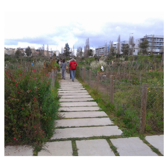
Image 3 - Quinta da Granja, public paths between plots, Lisbon.