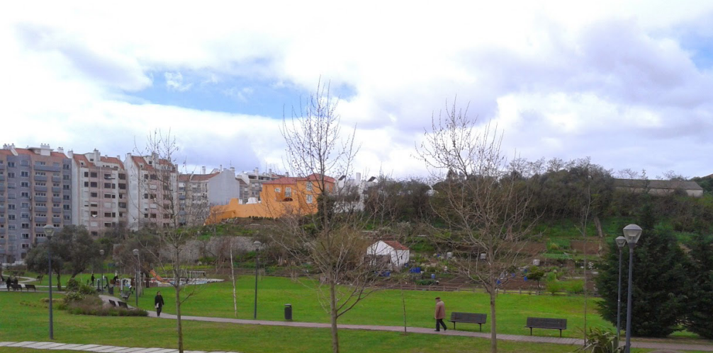
Image 6 - Allotment park Quinta da Granja, with the recreation park in the first plan and the growing areas at the back, Lisbon, Portugal.