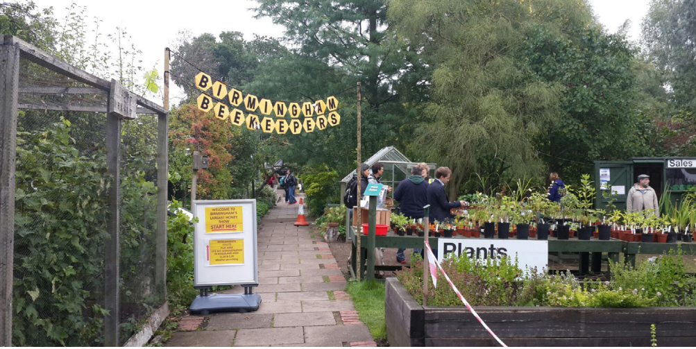
Image 2 - Beekeepers event open to the public, Martineau Gardens, Birmingham, UK.