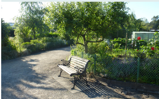
Image 4 - Benches along public areas, Hanbruch allotment garden, Aachen, Germany.