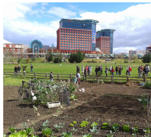
Image 7 - Allotment park Quinta da Granja, Lisbon, Portugal.