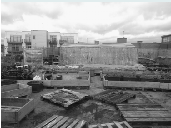
Image 6 - Makeshift greenhouse - Rooftop Community Garden, London, UK.

Temporariness: Although temporary arrangements may unlock possibilities to access land, they also imply that the project will come to an end in a few years from its start. It is therefore necessary that those individuals/groups that embark on a gardening project with a temporary lease of land use the time available to create strong bonds and plan for the future. The group and its project can survive after the lease is revoked, find other locations or transform the nature of the project. In other words, the process of implementation of a project matters as much as the project itself and can generate long-lived opportunities.