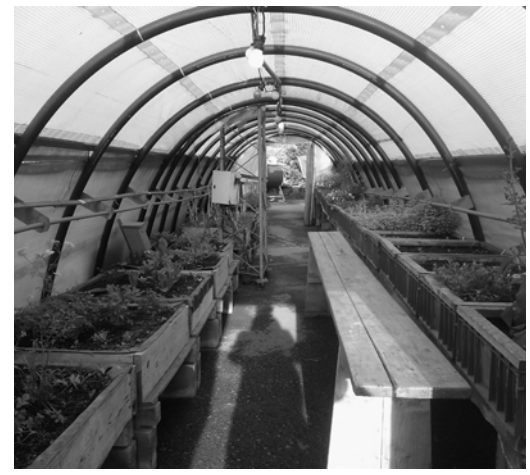
Image 3 - Skip Garden, greenhouse, London, UK.