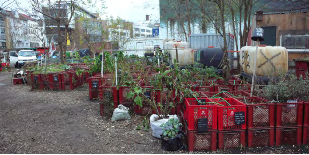
Image 4 - Prinzessinnengarten, Berlin, Germany.