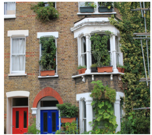
Image 5 - Vertical garden, London.