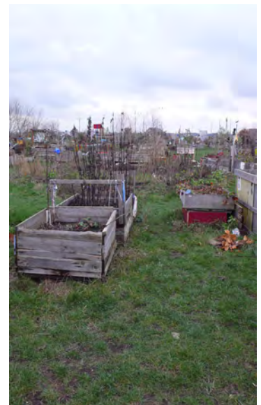
Image 7 - Community garden at Tempelhof airport, Berlin, Germany.

http://www.instructables.com/id/DIY-Hydroponics/