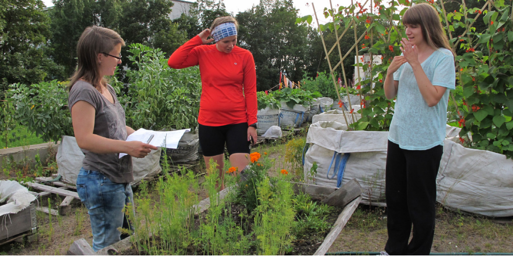
Image 4 - Planning the crop rotation for the next season together with a horticulturist. Kalevanharju community garden, Tampere, Finland.