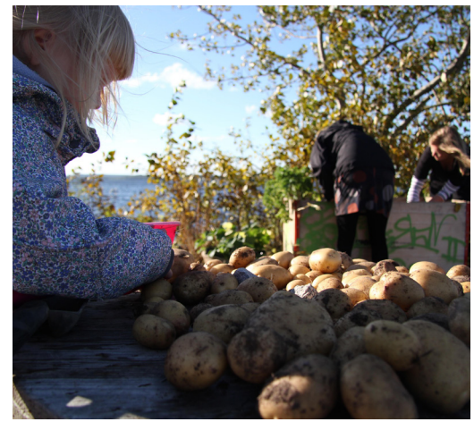
Image 5 - Child learning about potatoes, in Tampere, Finland.