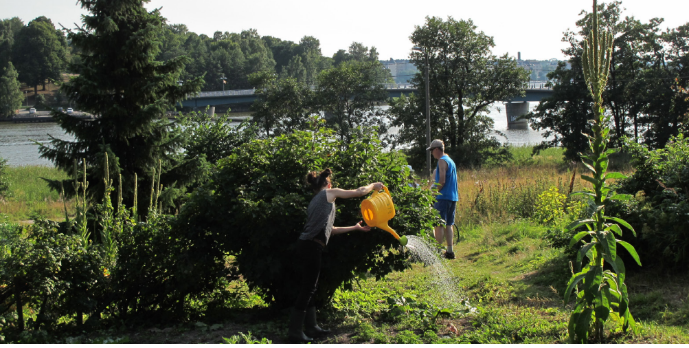
Image 2 - Watering the garden during a communal meeting at the Mustikkamaa Edible park, Helsinki, Finland.