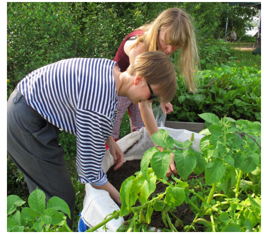
Image 3 - Learning harvesting together in Tampere, Finland.