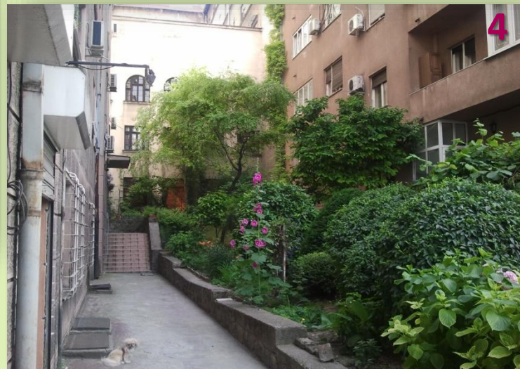
Figures 1-4: The best examples of urban gardening in inner yards in Belgrade, Serbia