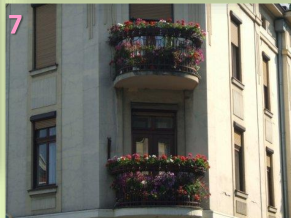
Figures 5-7: Positive examples of green balconies and terraces in Belgrade