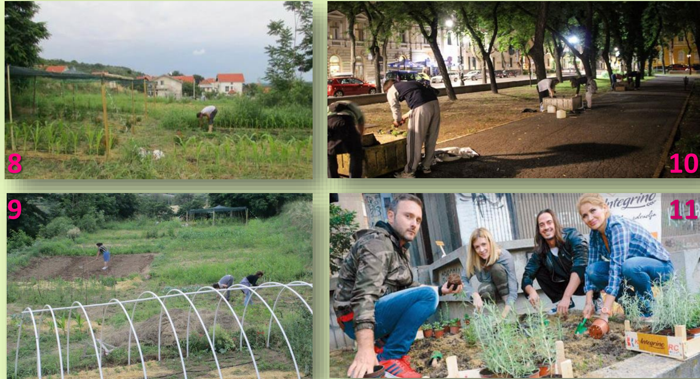
Figures 8-11: New approaches > First Belgrade garden community “Baštalište” (8-9) and “Guerrilla Gardeners” movement (10-11)