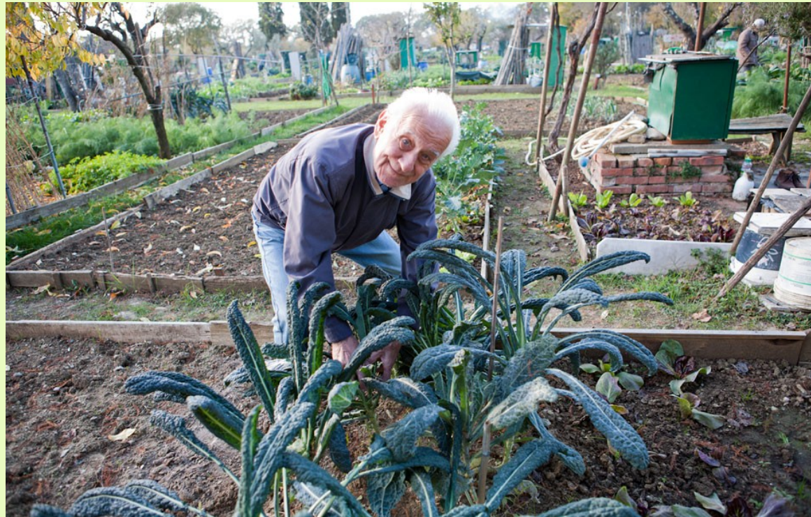
Urban gardens have been mainly enjoyed from elder people..