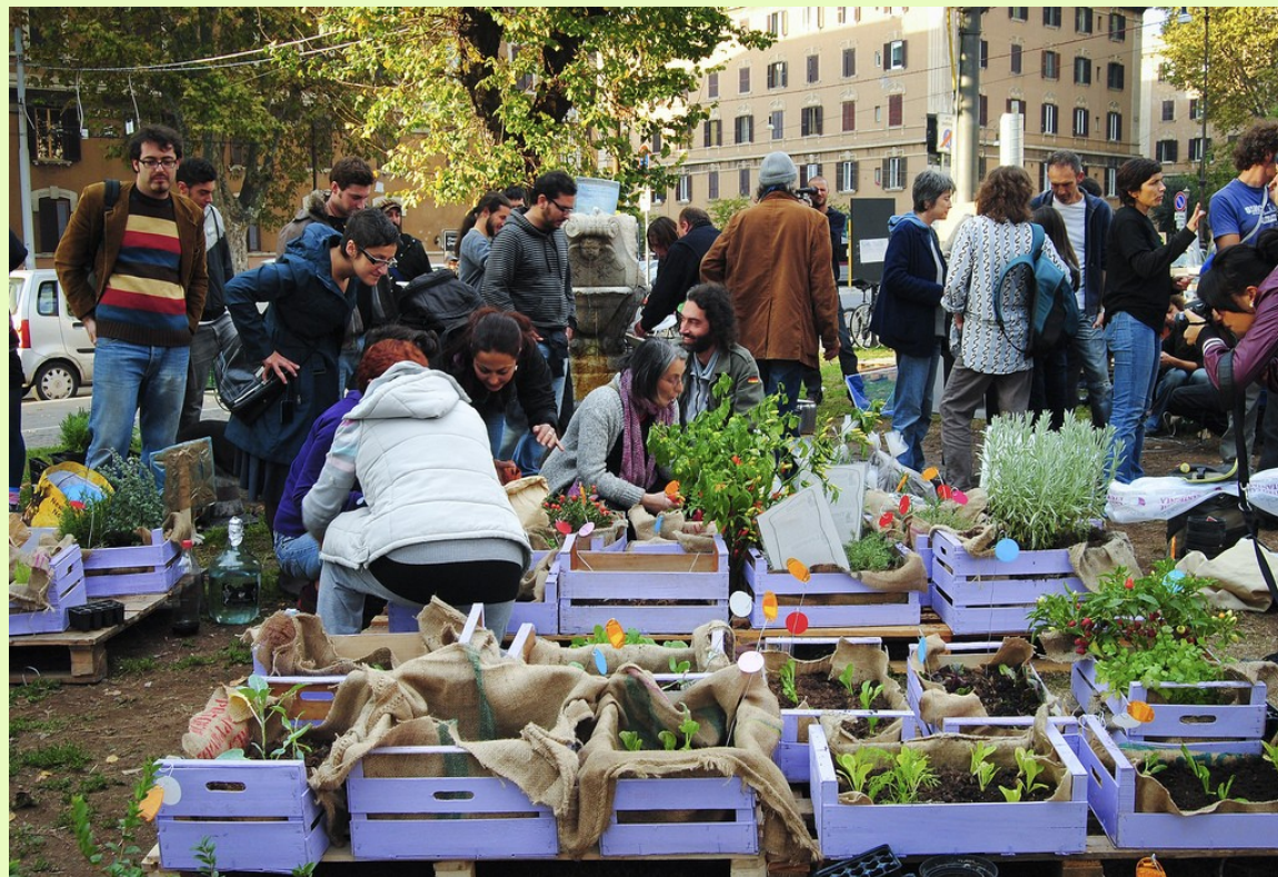
But something is changing... the gardens can become an open space for everybody!