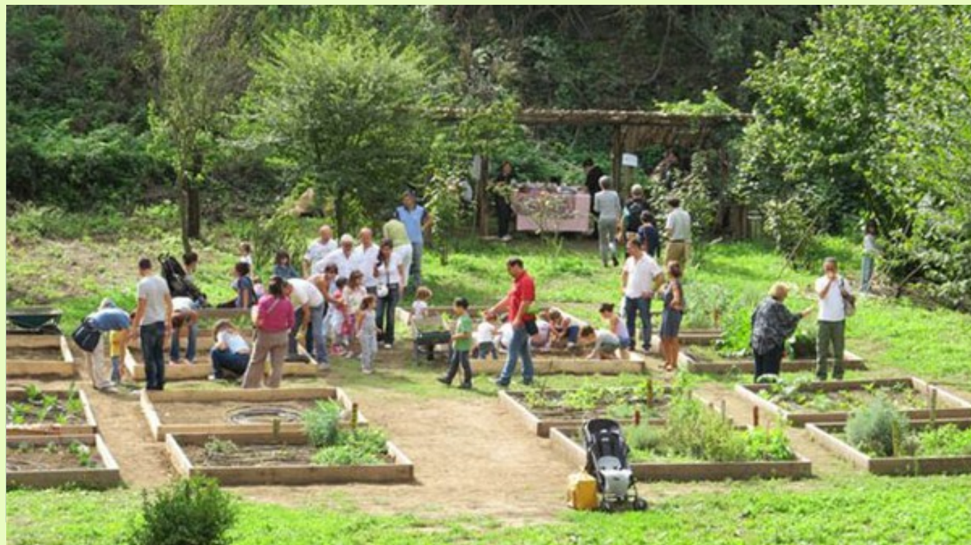
Hortus Urbis, Rome, a collective action of gardening.